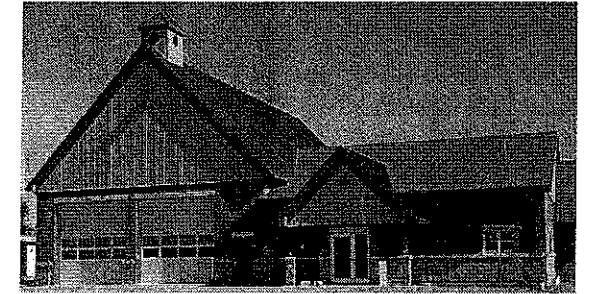
South Dorchester Community Hall 49431 Lyons Line, Lyons